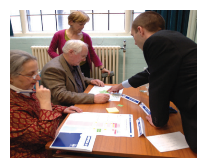
Oxford City Council Citizens' Panel indicating preferences for the council's budget allocation

Engagement methods and the extent of such a handover of decision-making power vary greatly nationally and globally. On one end of the scale, you might simply distribute 'project bespoke £ notes' at a workshop or citizens' panel asking participants to prioritise a list of developed public realm projects by pooling their individual budgets. The purpose of such a method is to gauge the nature of a collectively created list of priority projects.