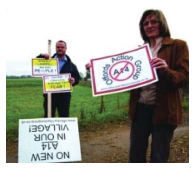
The threat of judicial review is increased when the adequacy of the consultation process is challenged

Provided this process is transparent, this is actually a sign of a healthy democracy. In the complex world we live in, no one is able to make the 'best' decisions on their own.